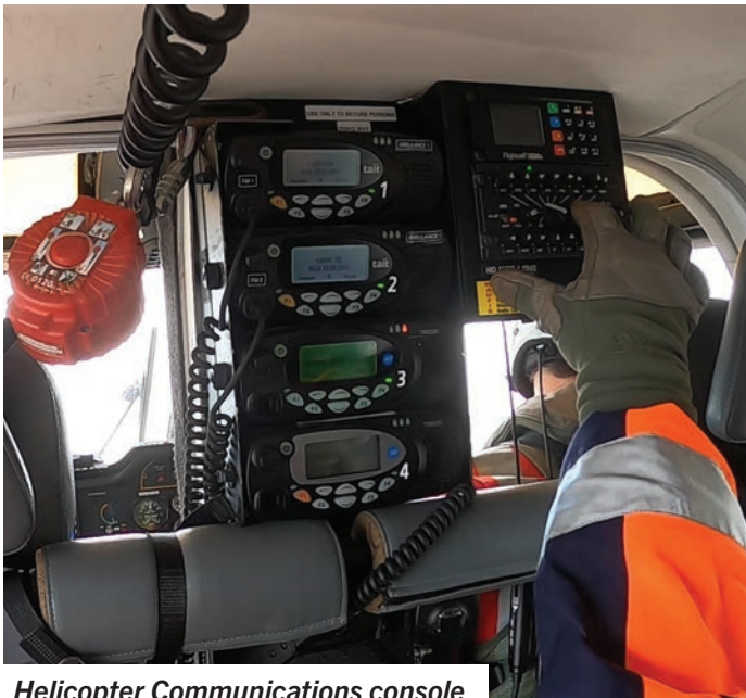
Helicopter Communications console