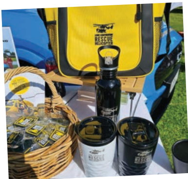
Cooler Bag & USB stick